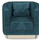
DEBBIE ARMCHAIR Page 96