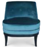
MARILYN ARMCHAIR Page 96