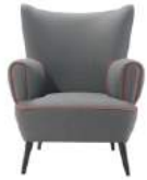
GARLAND ARMCHAIR Page 78