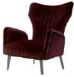
LOREN ARMCHAIR Page 76