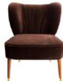
VISCONTI ARMCHAIR Page 84