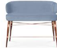
LOUIS TWIN BAR SEAT Page 79