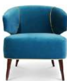
TIPPI ARMCHAIR Page 88