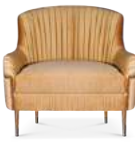
GRETA ARMCHAIR Page 96