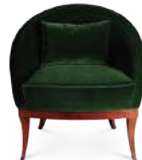
KIM ARMCHAIR Page 82