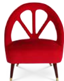
SCARLET ARMCHAIR Page 92