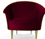
LUPINO ARMCHAIR Page 94